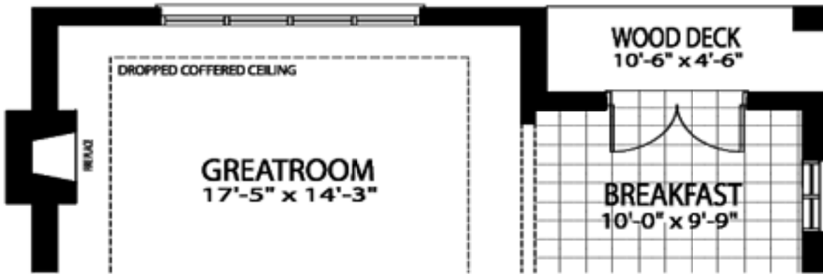
GROUND PLAN ELEV. 'A' + 'B' (WALK OUT CONDITION)